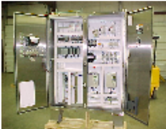
Custom PLC / VFD Controls