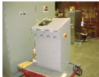
Custom Operator Consoles