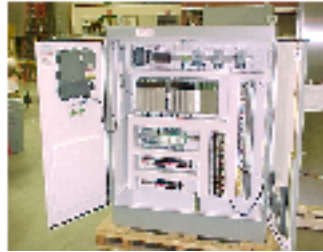
Custom PLC Controls