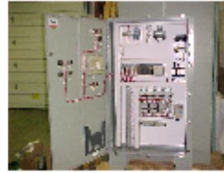
Custom PLC / Motor Starter Controls